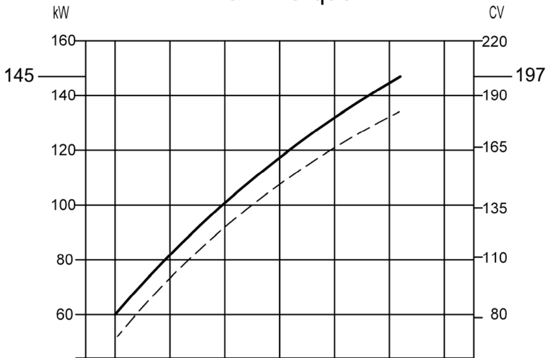
Potencia - Power