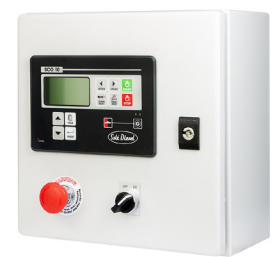
IP 65 Box Kit